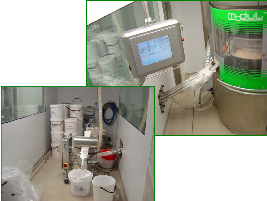
Photo 3: MODUL™ tablet press in contamination free room, with downstream equipment and tablet recipients in separate room

This “through the wall” (TTW) concept calls for separate clean rooms. These can be created easily by installing a thin separation wall in an existing clean room. The MODUL™ tablet press is installed in one room, while the downstream equipment and tablet recipient(s) are installed in another. The tablet chute of the tablet press goes through the separation wall into the peripheral equipment. Thanks to the ECM concept, the closed powder feeding and contained tablet transition to the other room, the room containing the MODUL™ does not need any cleaning, as no dust is released into this room. Room cleaning is now limited to the second, much smaller room, further reducing the change-over time of the tableting line.