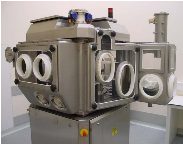
Photo 5: Courtoy R190HC: high-containment tablet press based on traditional isolator technology

The first concept, a tablet press with isolators, does indeed offer the highest possible level of isolation. Courtoy has supplied such a machine to one of its customers for development purposes. Measurements and analyses have indicated that the containment level is indeed extremely high. On the downside, cleaning, format change-over and maintenance are very difficult and time-consuming, due to the constraints of the isolators and glove port access.