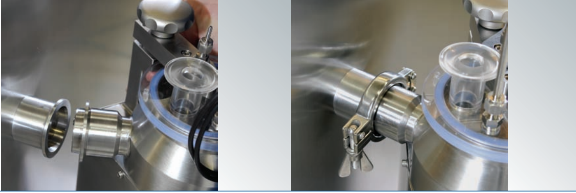
PharmaConnect® 'plug and play' module approach for Granulating, Blending and Pelletizing.