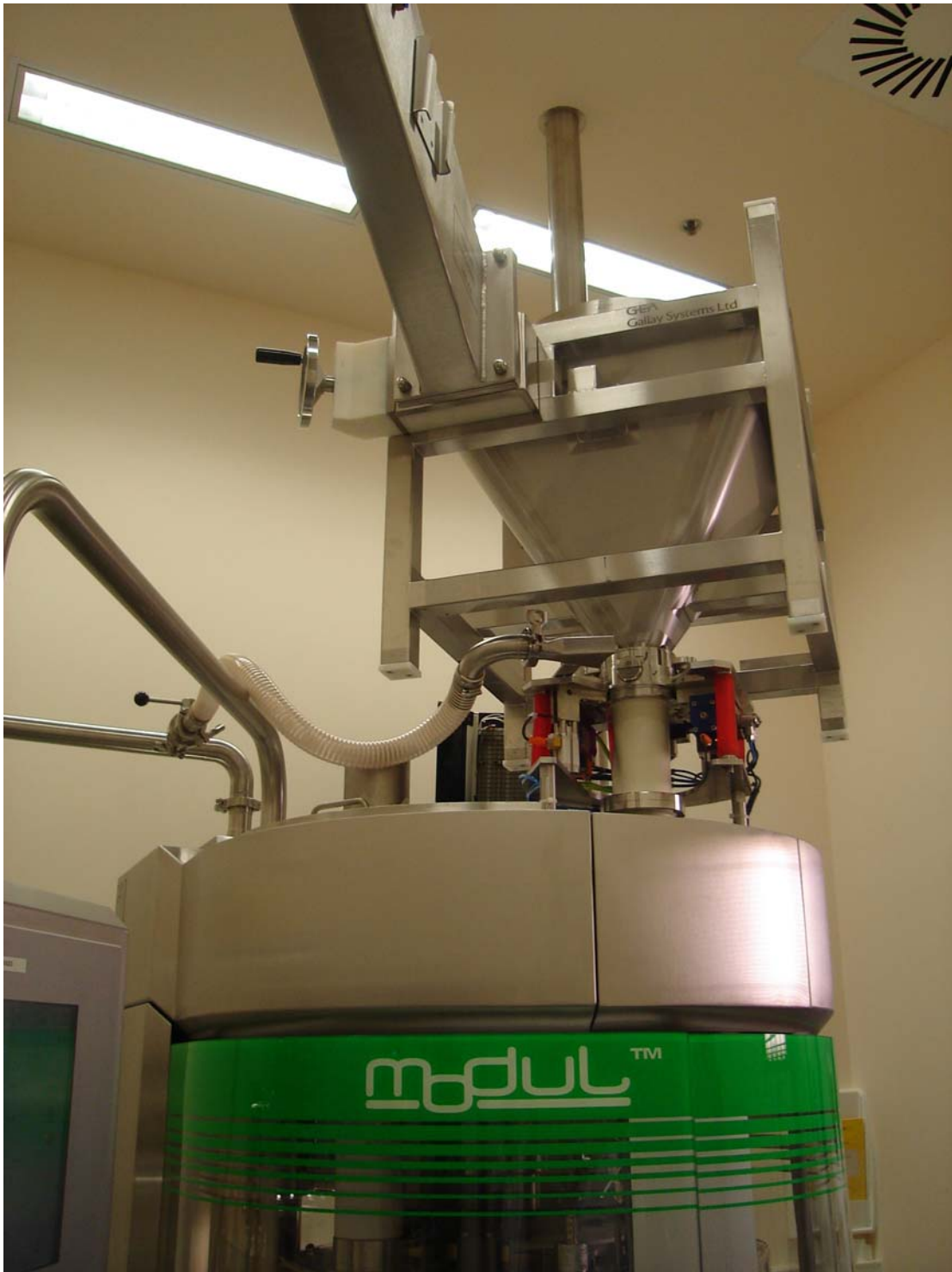
PHOTO 3: Buck DN100 High-Containment Quick-Release valve & Buck powder IBC