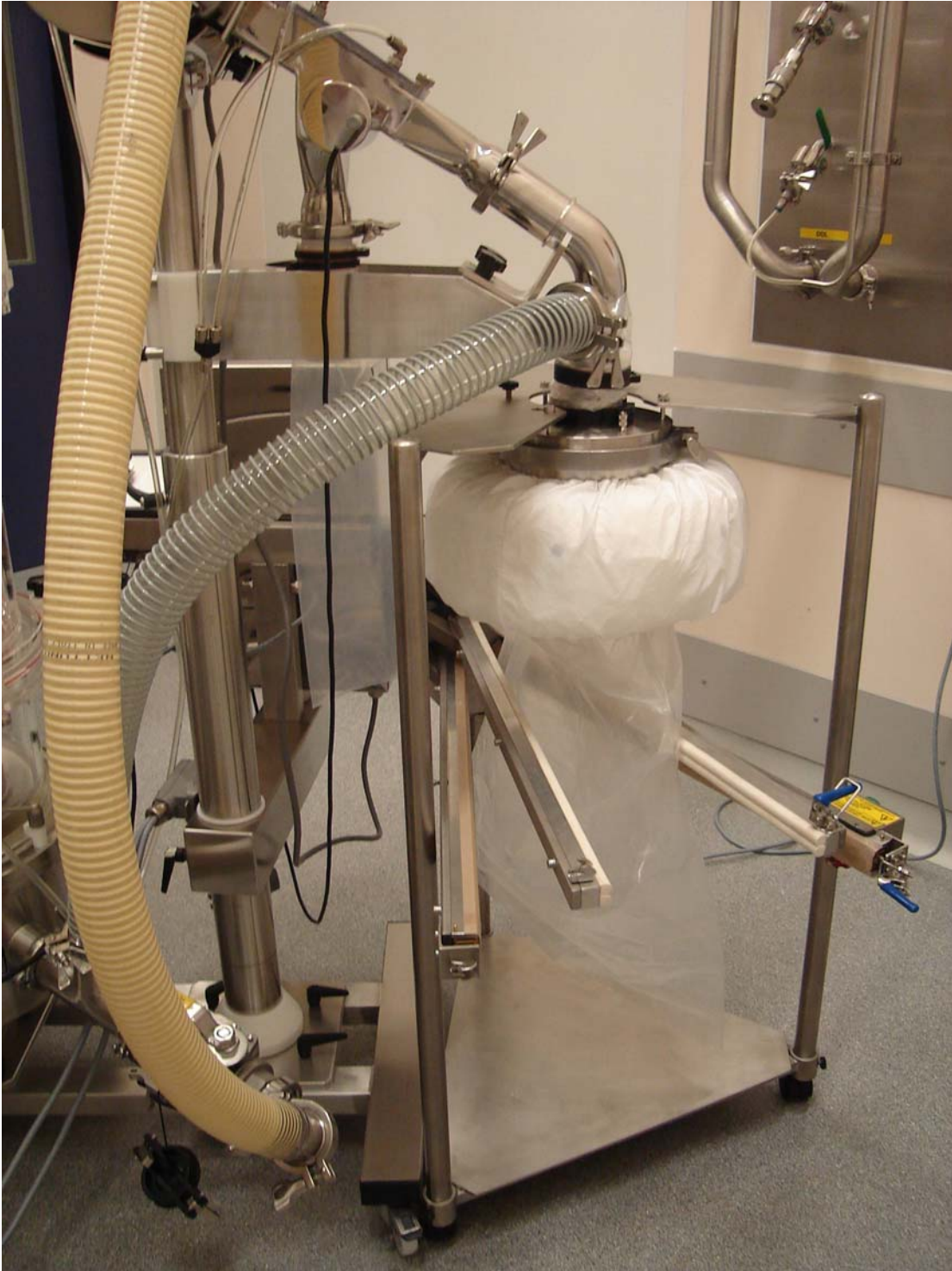
PHOTO 5: Contained tablet recipient based on LDPE continuous liner