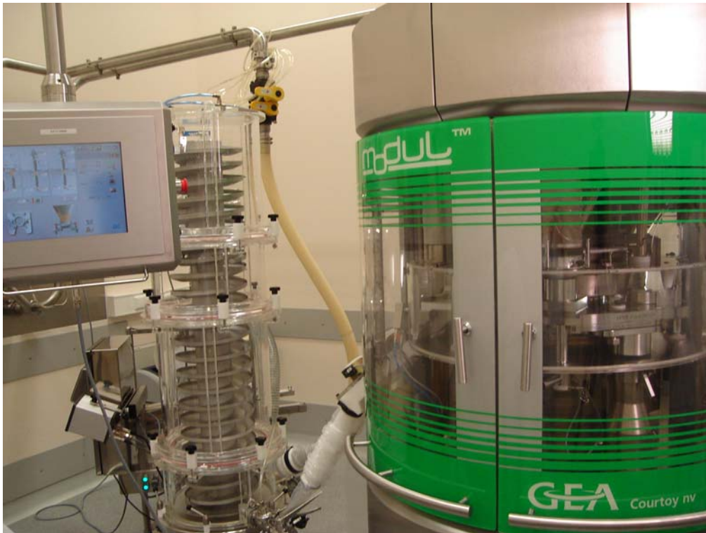
PHOTO 1: MODUL™ S tablet press with Multi-Control 4 interface panel